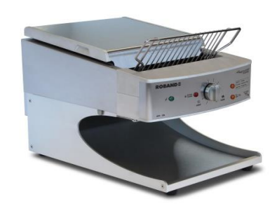
SYCLOID CONVEYOR TOASTER